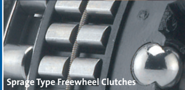
Sprage Type Freewheel Clutches